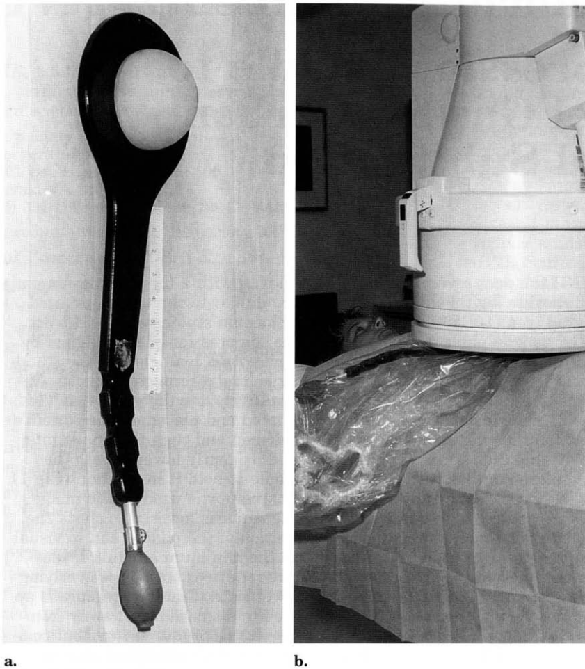
Figure 1. (a) Balloon-type compression paddle with a 4-inch-diameter (10 cm) balloon. (b) Simulated angiography patient with the balloon paddle held in place by the image intensifier.

structive pulmonary disease (COPD) and was unable to suspend respiration. Because of underlying chronic renal insufficiency, CO 2 DSA was used to evaluate the abdominal aorta and right iliac arterial system. A large amount of small bowel gas was present in the pelvis. The patient was tachypneic at baseline and unable to suspend respiration during imaging. The bowel gas moved with each diaphragmatic excursion, resulting in subtraction artifact despite lack of peristalsis. Despite using catheter repositioning and repeated imaging in multiple obliquities, the right iliac arterial system was not adequately visualized ( Fig 2a ).